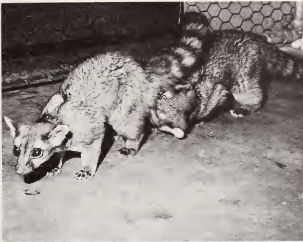
Fig. 2. \delta sniffing \text{f} ano-genitally prior to mounting

The reproductive strategy of the \delta B. sumichrasti , attempting copulations many days prior to the receptivity of the \text{f} , markedly differs from the copulatory pattern of B. astutus , whose attempts at copulation are restricted to a 24-h-period, and the \delta is almost always successful in achieving penetration early (POGLAYEN-NEUWALL 1987).